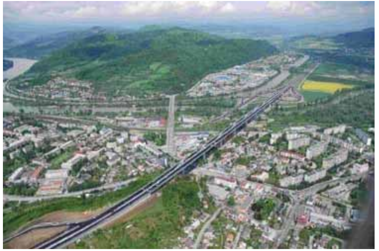
D1 motorway Sverepec-Vrtizer, co-financed by the EU Cohesion fund

The Road conference 2010 , sponsored by the Minister of Transport, organized by the Slovak Road Society, focusing on road management and technical policy and legislation issues, road network development and modernization, funding and financing of road building, maintenance and operation, implementation of PPP projects (DBFO), experience in the introduction of electronic toll collection system as of 1 st January 2010, the new Road act and the National System of Traffic Information being developed and to be co-financed by EU fund was held from 25 th to 26 th March 2010 in Bratislava.